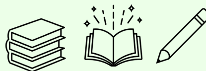
Reflective Readers and Writers

I’m becoming more aware of the similarities and differences between myself and others, and showing interest in the close to me, as well as others around the world. I’m continuing to understand the need to respect and care for the natural world and love to explore using all my senses on trips.